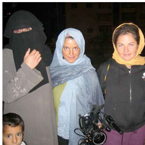
Filming in Baghdad, Iraq