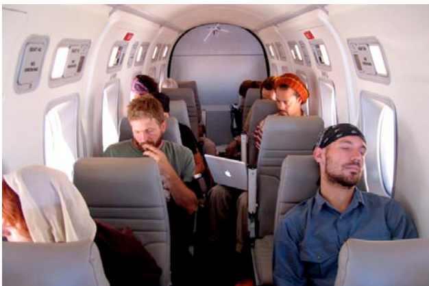
Flying to Baghdad, Iraq

In 2004, I took time away from teaching to dedicate myself to more creative and active projects; in particular I journeyed to Iraq, Palestine & Israel with American musician and social activist Michael Franti to film and document the 'human' cost of war. I then lived in San Francisco for seven months while assisting in the editing of the documentary, titled 'I Know I'm Not Alone.' For me, this journey reinforced what I had previously thought, that media could never capture the reality on the ground, but that it certainly has a responsibility to present both sides of the story. And for those of us in the Western world, we as individuals and a collective have a responsibility to not judge situations based on our own ideologies. There is always two sides of the story.