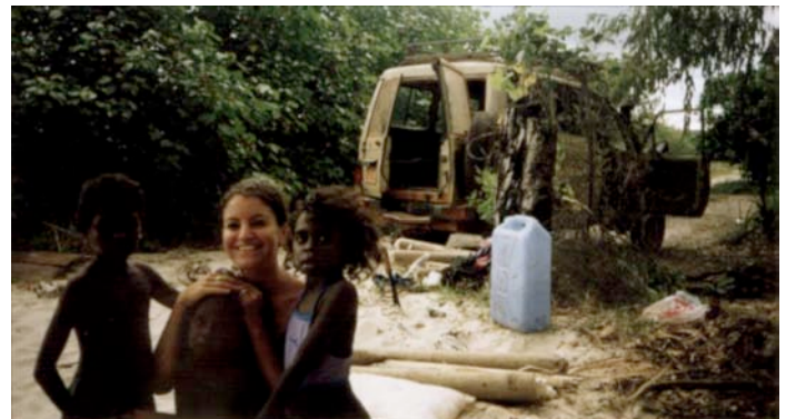
My first time in Arnhem Land, Daliwuy Bay

This first community I visited was Yirrkala, a stronghold of Yolngu culture and the home place of the yidaki. (didgeridoo) Here I was adopted into a Yolngu family and from that time onward, I became part of their kinship system, which gave me the foundation to learn about their culture and their livelihood. To this day, this family who adopted me are close to my heart, they are literally like my extended family. Over the years I have visited and worked in Yirrkala, Maningrida and Galiwinku communities as a teacher. English is usually the 4 th or 5 th language for these children, so bilingual education has been important in their learning. I have made lasting friendships with the beautiful people living in these places and I have also had the pleasure of documenting their lives in video and photography.