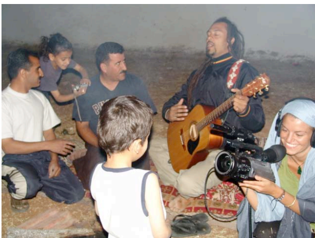
Filming in Palestine