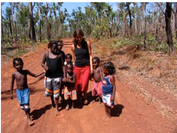
Banthula, Elcho Island