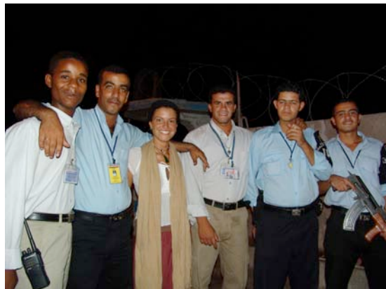
Checkpoint in Baghdad